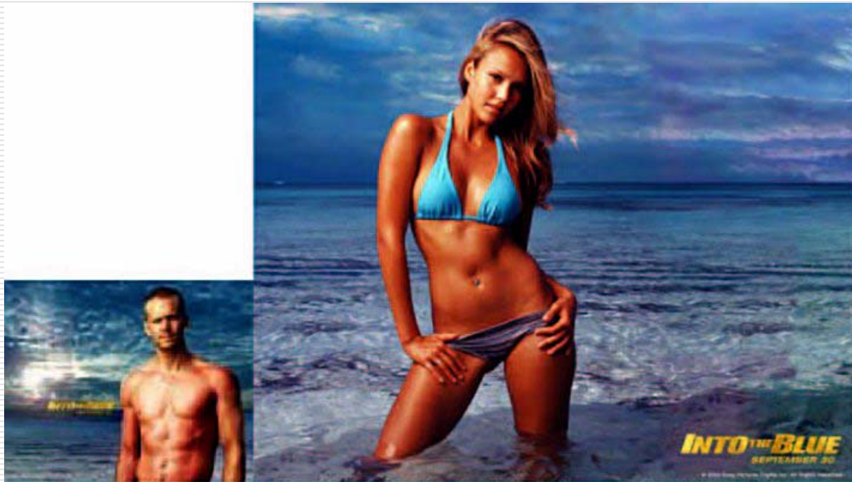
Paul Walker, and Jessica Alba in the Sony Pictures film, Into the Blue , 2005